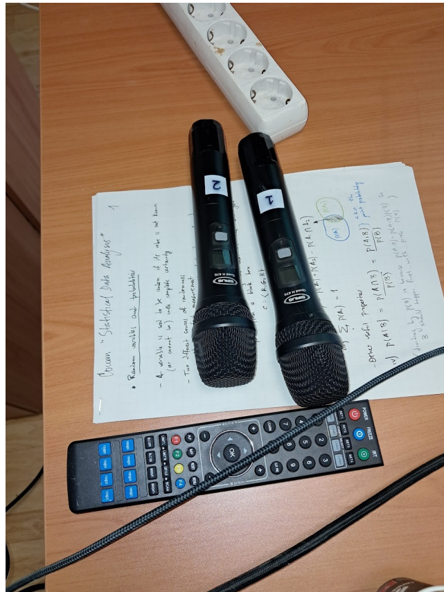
Figure 4: These two microphones work and are connected to the laptop and to the central audio system using the USBc