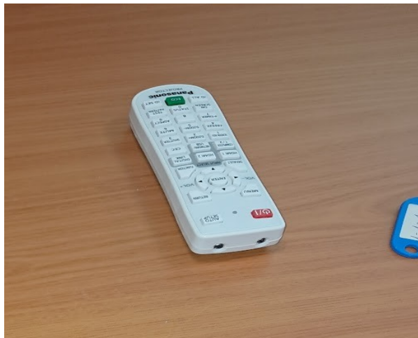
Figure 1: Control remote for the projector