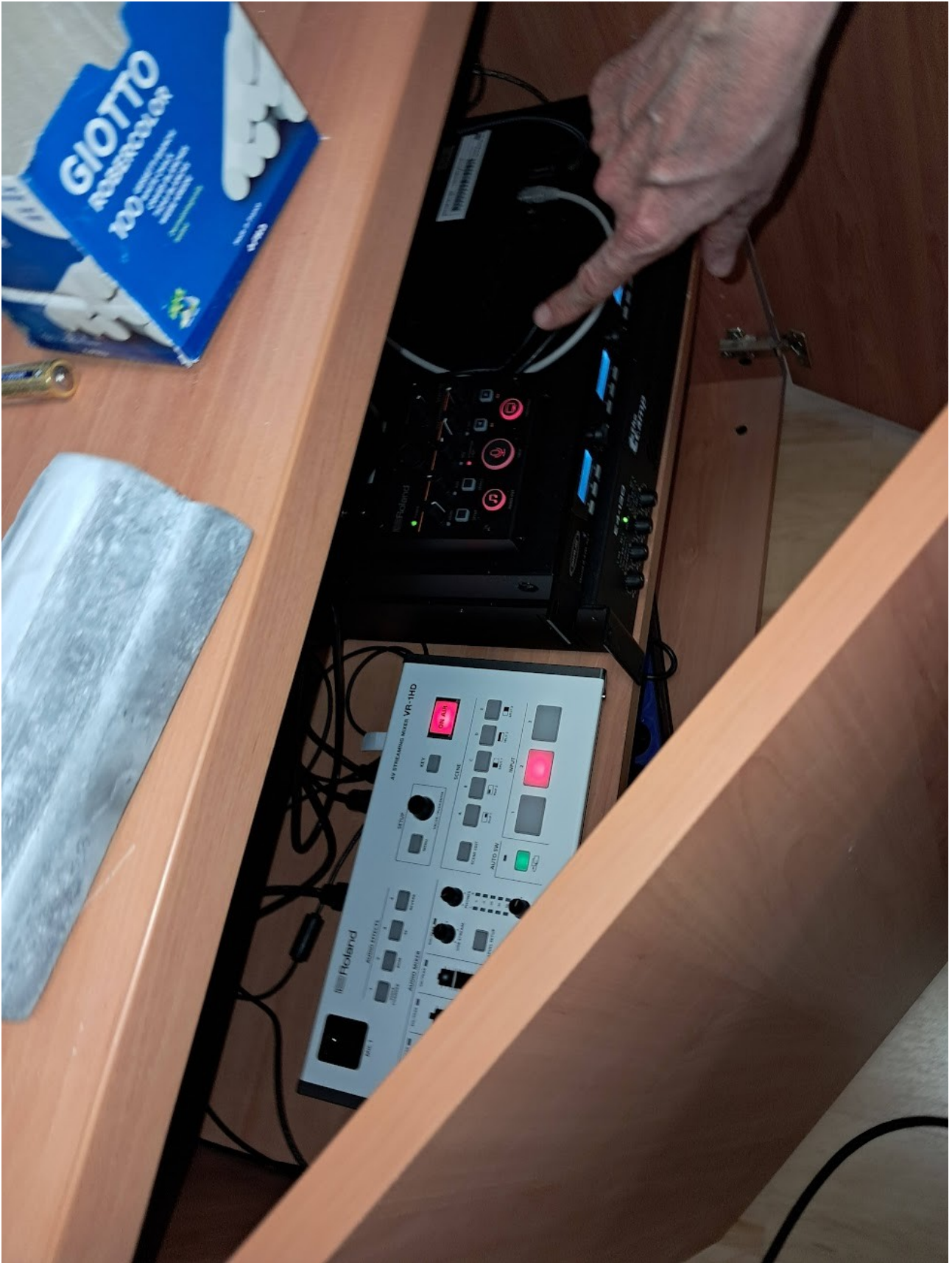
Figure 5: DO NOT OPEN AND DO NOT TOUCH ANY BUTTON HERE