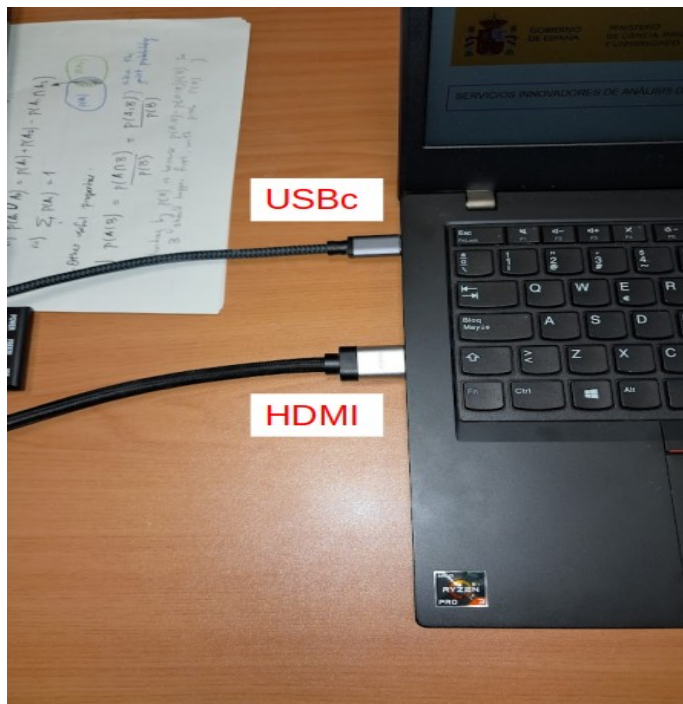
Figure 2: The laptop is connected to a central hub that controls speakers/microphones/cam/ethernet